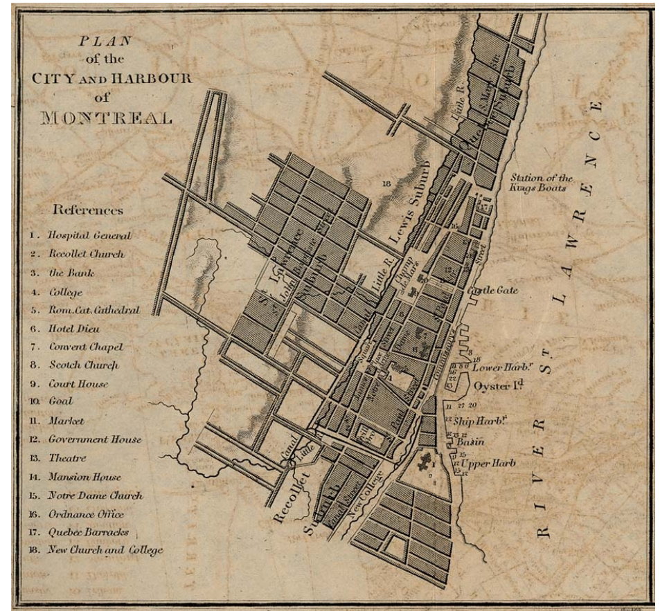
Perry-Castañeda Library Map Library