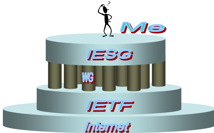
“The Community View”