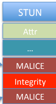
STUN Binding Request (Connectivity Check)